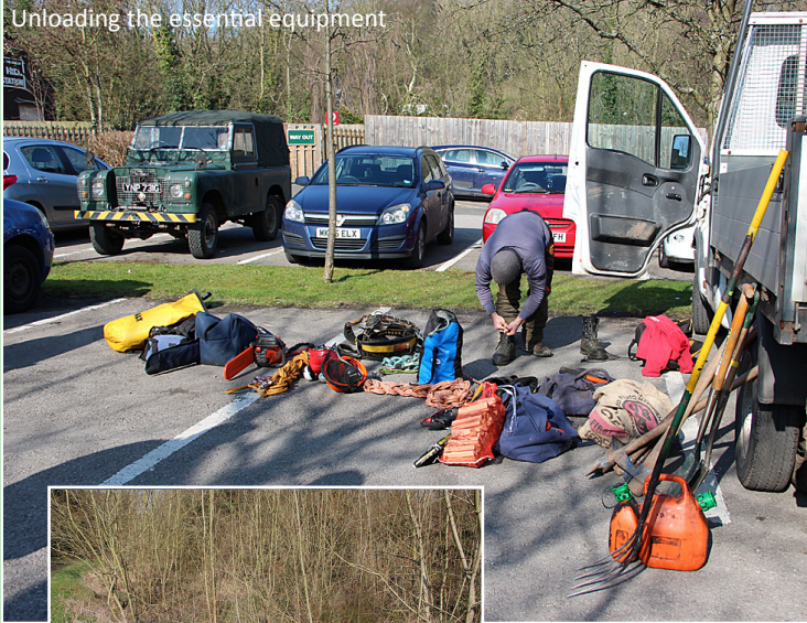
Unloading the essential equipment