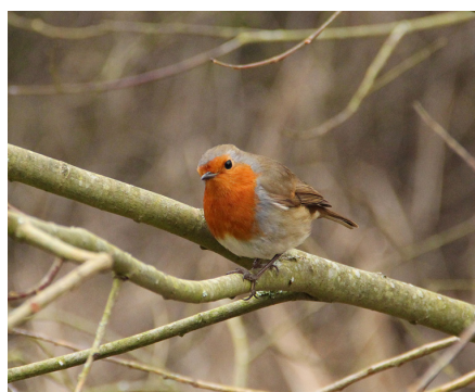
...as plans are developed

After careful consideration and inspection of the woodland area and canal basin, plans were developed to undertake some remedial tree management and planting and clear young trees which had taken hold in the canal basin.