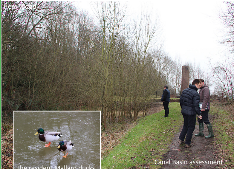
The resident Mallard ducks 'walking on water' on the frozen Canal near the Town