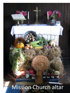
Mission Church altar

Produce from the Polytunnel and the allotment are used on a regular basis throughout the Town but especially so on Special Event days such as the Harvest Festival celebrations which take place in the Mission Church and the Victorian Pleasure Gardens.