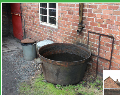
A large cast-iron pot makes an excellent water butt, situated close to the allotment

By the summer of 2014 the Polytunnel was well established. Our resident gardener Jane Gledhill-Higgins and a team of excellent volunteers worked extremely hard to stock and nurture a multitude of flowers and vegetables which are used, mainly for display purposes throughout Blists Hill Victorian Town everyday in the shops and cottages