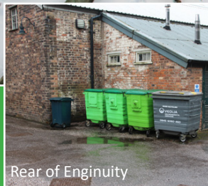
Rear of Ennigunty