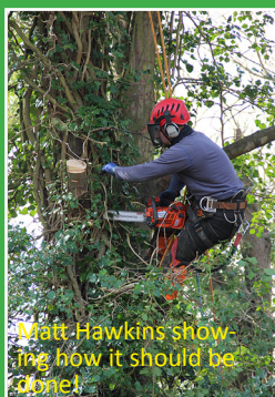
Matt Hawkins showing how it should be done!