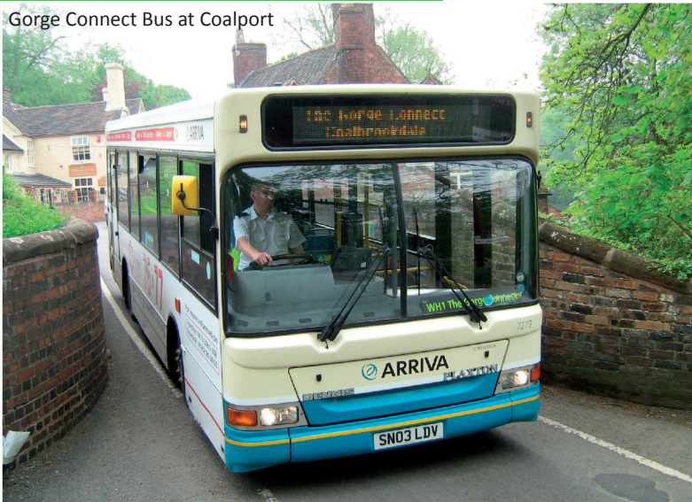
Gorge Connect Bus at Coalport

The Telford & Wrekin Council Gorge Connect bus service links to Ironbridge park and ride site via the Museum of the Gorge bus interchange and links all Ironbridge Gorge Museums including Blists Hill Victorian Town.