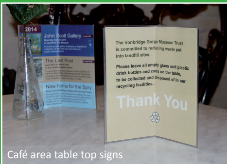
Café area table top signs

The Museum catering team are on-board with ensuring as much recycling is achieved as possible and rather than have bins inside the café, visitors are encouraged to leave all their recycling on the tables to enable the catering staff to clear everything away and take care of the recycling.