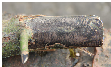
The branch to the left was found on the woodland floor - teeth marks probably made by wood mice or other small woodland mammal.