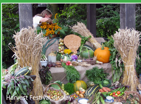
Harvest Festival display