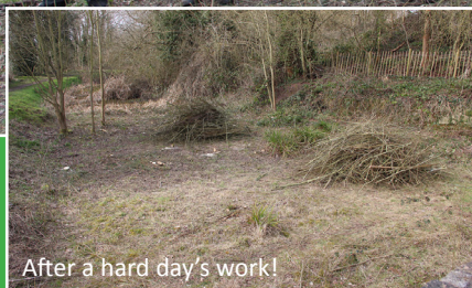
After a hard day's work!