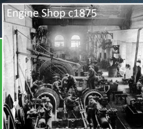
Engine Shop c1875

The Engine Shop, once a heavy industrial manufacturing area, now hosts a continual calendar of Corporate and Banqueting functions for the Museum, private clients and public organisations.