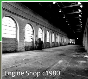
Engine Shop c1980