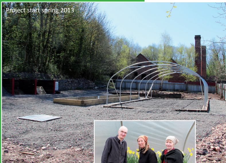
Project start spring 2013

Capgemini staff helped to clear this semi-derelict area adjacent to the Brick & Tile Works at Blists Hill Victorian Town and helped to create compost bays, build retaining walls, raised planting beds and erect the polytunnel.