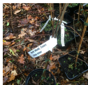
Ulmus Minor (Elm)