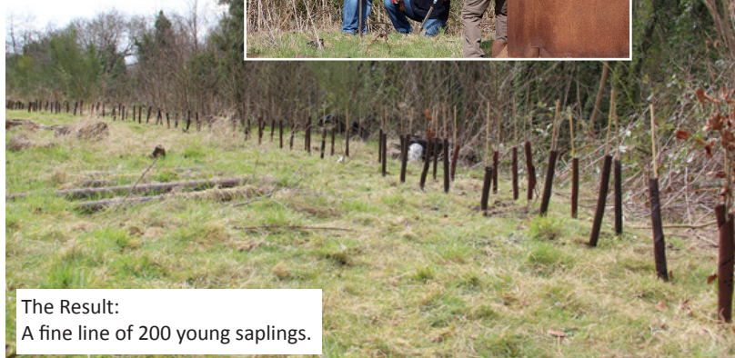
The Result: A fine line of 200 young saplings.