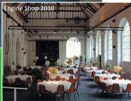
Engine Shop 2010