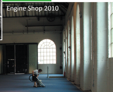
Engine Shop 2010

The Engine Shop, once a heavy industrial manufacturing area, now hosts a continual calendar of Corporate and Banqueting functions for the Museum, private clients and public organisations.