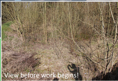
View before work begins!