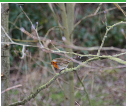
A resident Robin looks on with interest...