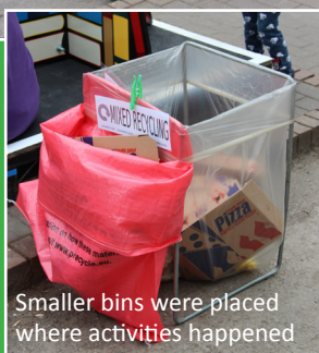
Smaller bins were placed where activities happened