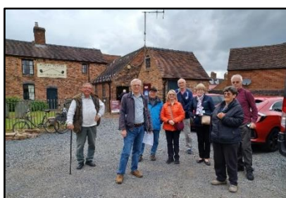
Friends gather for a tour of the Broseley 'Jitties' following a guided tour of the Broseley Pipeworks

Membership of the Friends takes many forms in the support it offers the Museum; volunteer guiding is a more public form of support but there are many opportunities for behind-the-scenes support at the various Museum sites, in the Archives, working with the 'Steam Team' or assisting in a varied range of activities that extend from costumes to engines! By joining the Friends, you are not only providing financial support to the Museum but have the opportunity to utilise your skills, learn new ones or simply extend your network of friends; your membership will help spread the message about the Museum and the work of the Friends in supporting it.