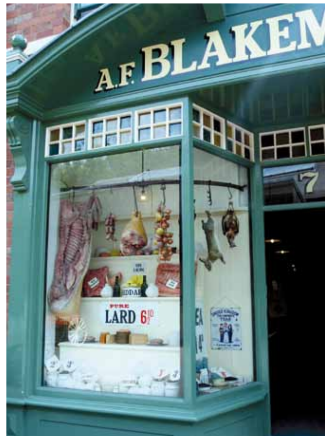
Grocers A F Blakemore & Son at Blists Hill VICTORIAN TOWN

Following a donation from the Worshipful Company of Grocers, work was completed on the World Heritage Site Exhibition space within the Visitor Centre at Blists Hill Victorian Town. Also at Blists Hill Victorian Town a major refurbishment of the Grocers Shop was completed thanks to a donation from The Blakemore Foundation.