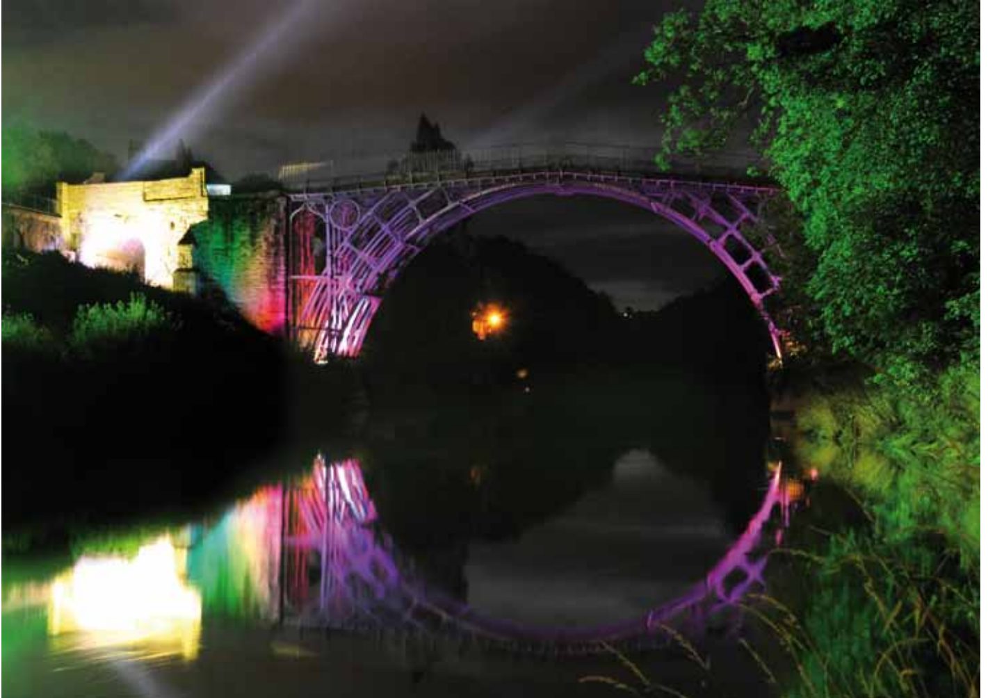
The Iron Bridge lit for the Ironbridge Gorge World Heritage Festival