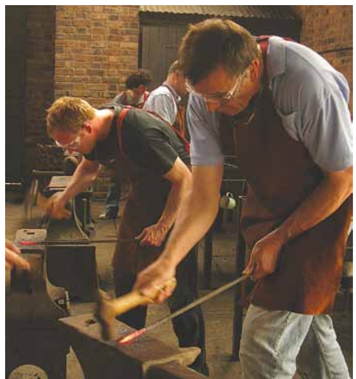
Blacksmithing workshops at Blists Hill VICTORIAN TOWN