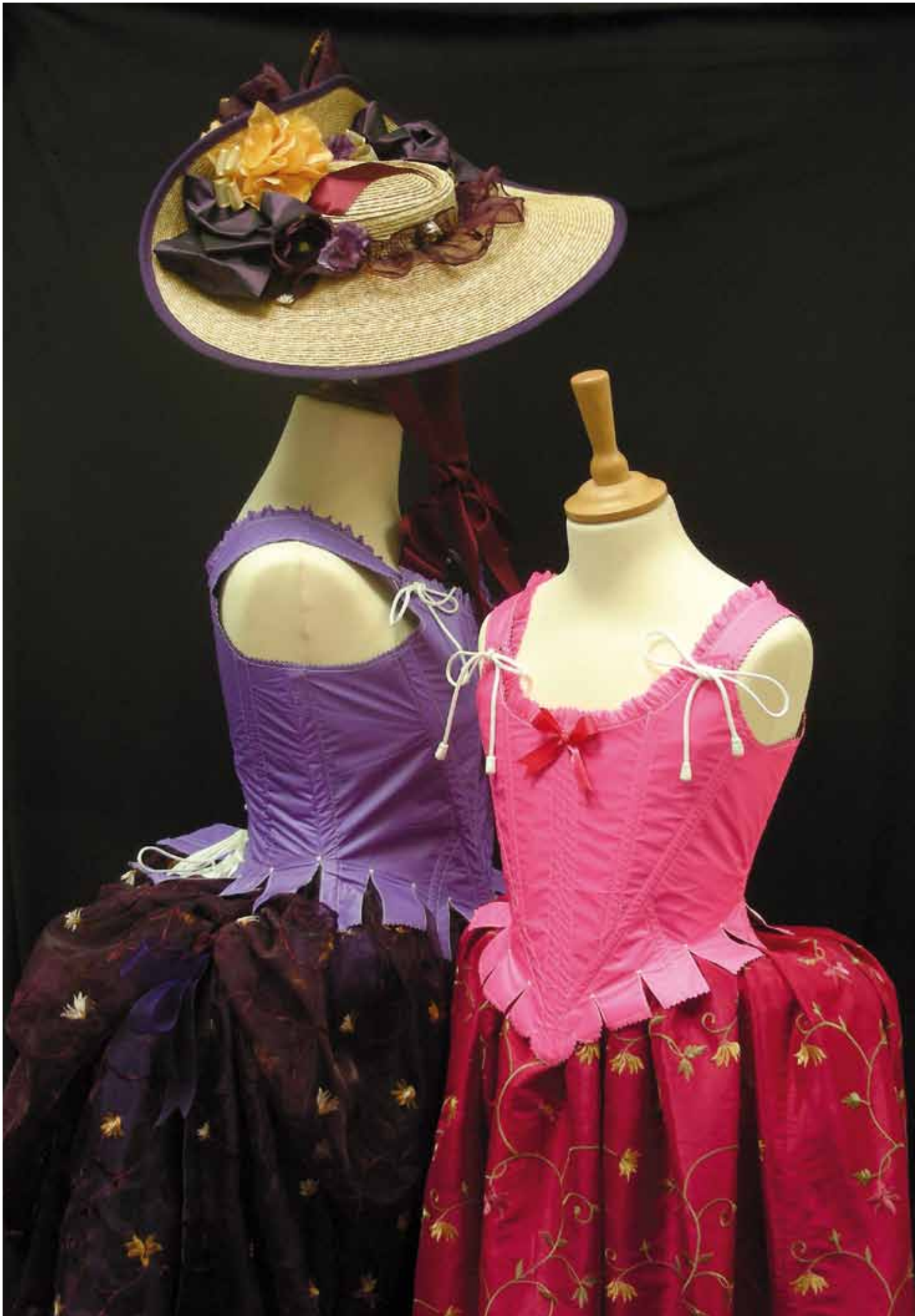
Reproduction Georgian try-on costumes made for the Samuel Johnson Birthplace Museum by the Costume Project