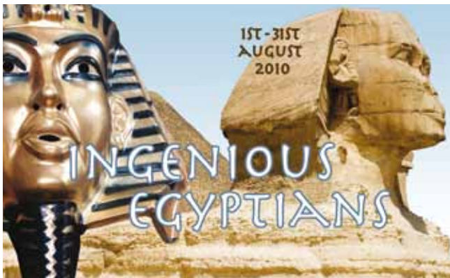
'Ingenious Egyptians' programme of events

During the summer the education team at Enginuity inspired children to learn more about the technologies behind the construction of the Pyramids as part of the 'Ingenious Egyptians' programme. The hands-on design & technology workshops were supported with original Egyptian artefacts on loan from Birmingham Museums & Art Gallery.