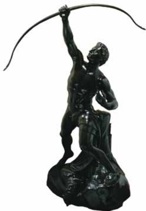
The Eagle Slayer from the Museum's Collections

Through the Renaissance in the Regions Creative Industries Project the Trust's retail business saw the benefit of a number of improvements to its shops, with the Museum of Iron Shop and the Museum Gift Shop in Central Ironbridge both undergoing refurbishments. A new retail brand 'From Our Collections' was launched with the product range being inspired by the Designated Collections, monuments and architecture in the care of the Trust. This brand complements the Trust's premium retail brand 'Made in the Gorge' which features the work of designers, makers and artists from within the Ironbridge Gorge World Heritage Site.