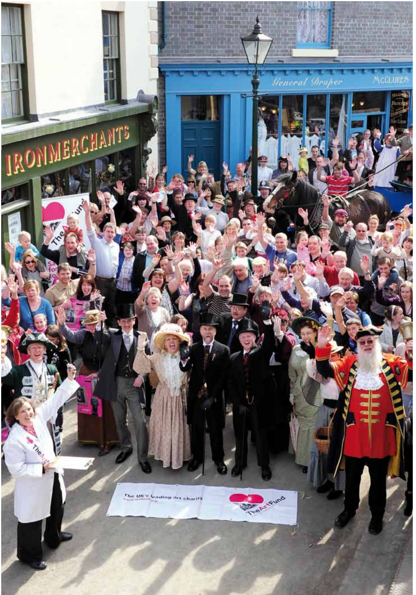
Love Your Museum weekend in Canal Street, Blists Hill VICTORIAN TOWN, April 2010