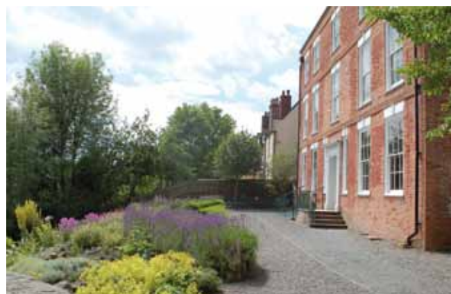
Darby House gardens in full bloom

A new Five Year Strategic Plan 2010 – 2014 for the Trust was published in 2010 underpinned by a new two-year Business Plan. A Five Year Fundraising Strategy was approved by the Trustees at the beginning of 2010 which complements and works in parallel to the Museum's overall Five Year Strategic Plan. The Fundraising Strategy focuses on the long-term sustainable development and maintenance of the buildings and monuments within the Trust's care. One of the first stages of delivery against this Strategy was the launch of a new legacy campaign in September 2010 with a number of initiatives including presentations, new promotional literature and new website pages being developed.