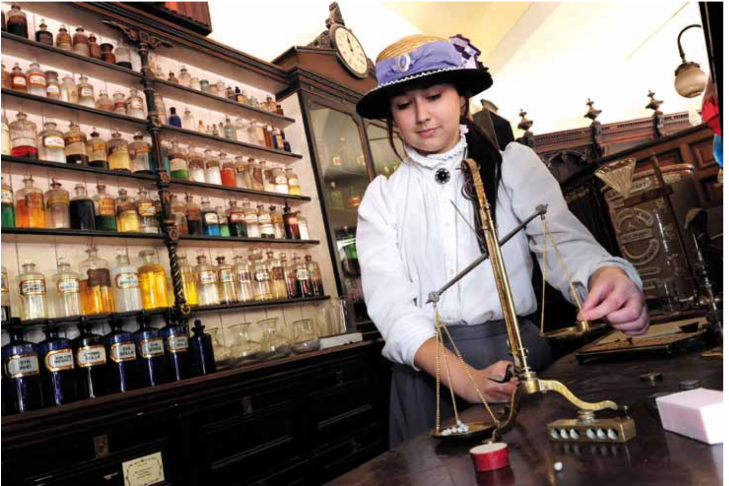
The Victorian Pharmacy at Blists Hill VICTORIAN TOWN