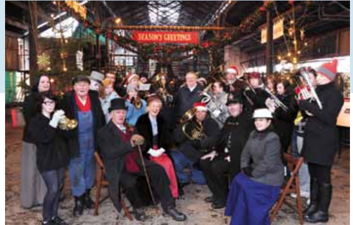
A Victorian Christmas at Blists Hill VICTORIAN TOWN