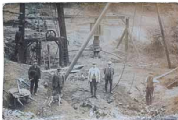
Previously unseen photographs of mining scenes in the area

Ironbridge was the coordinating regional partner for Shropshire as part of the British Museum led project A History of the World in 100 Objects, to which the Museum contributed five items, helping with local publicity and liaising with other museums in terms of their artefacts.