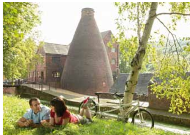
Coalport CHINA MUSEUM

In the autumn, the Museum was a partner in the delivery of the Ironbridge Gorge World Heritage Festival, project managing the lighting of the Iron Bridge and key historic monuments, including the Museum of the Gorge, as part of the weekend's very successful programme. Museum volunteers helped with stewarding duties over the weekend and the Friends of the Ironbridge Gorge Museum had a market stall on the Wharfage.