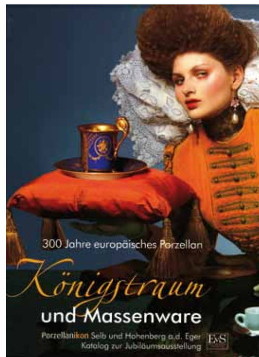
Brochure for the 300 Years of European Porcelain Exhibition

During the year the Museum made many loans from its Nationally Designated Collections, including loans of major works from its Coalport and Caughley collections to international ceramic museum Porzellanikon for its blockbuster exhibition 'From a King's Dream to the Mass Produced'.