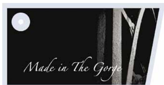
Development of new brands 'Made in The Gorge' and 'From Our Collections'

Also as a result of Renaissance funding a new Volunteer Centre was established during the year in the former Hot Metal Cafe outside the old entrance to Blists Hill Victorian Town. This adaptable space provides a permanent base for the Trust's many volunteers as well as proving a much needed flexible meeting space for community groups, events coordination and the Museum's staff.