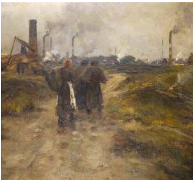
'Evening in the Black Country' by Edwin Butler-Bayliss

Through loans from the Wolverhampton Museum & Art Gallery, the Museum put on an exhibition of Black Country artist, Edwin Butler-Bayliss. The exhibition, entitled 'Black by Day, Red by Night' was popular with a wide audience with many visitors enjoying the work of this little-known Royal Academy artist.