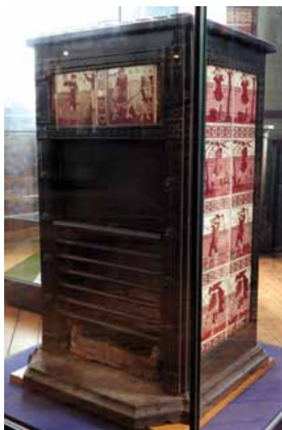
Coalbrookdale Company Stove acquired with the generous support of the V&A Purchase Fund

With the generous support of the V&A Purchase Fund and supporters of the Museum, the Trust also acquired a rare Coalbrookdale Company Stove with Craven Dunnill Tiles in the autumn. Our sincere thanks go to all who kindly donated objects, photographs and other material to the Museum during 2010.