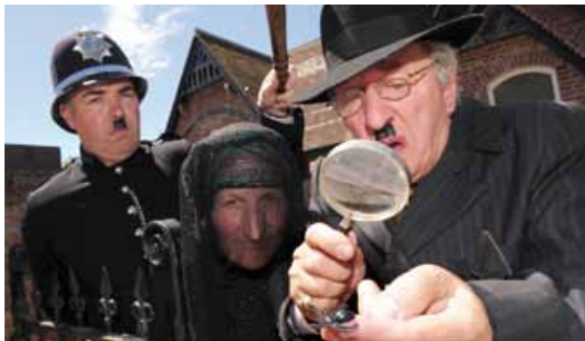
Sundial Theatre perform 'Inspector Drake & The Black Widow' at the MUSEUM of THE GORGE

2010 saw a number of very successful large-scale events across the 10 museums, including Ghostly Gaslight, Fireworks Night and the Victorian Christmas weekends at Blists Hill Victorian Town, although very severe weather for the latter proved a significant challenge to the Museum's operations team. In May, the Museum once again hosted a successful fundraising evening for Hope House Children's Hospice at Blists Hill and supported the annual Brass Band Festival in July, now firmly established as one of the musical highlights of the Shropshire calendar with all income raised from the event supporting the work of the Severn Hospice. In partnership with Sundial Theatre, the Museum introduced professional theatre to the Museum of the Gorge in August with the black comedy 'Inspector Drake and the Black Widow' being performed to a combined audience of over 350 people.