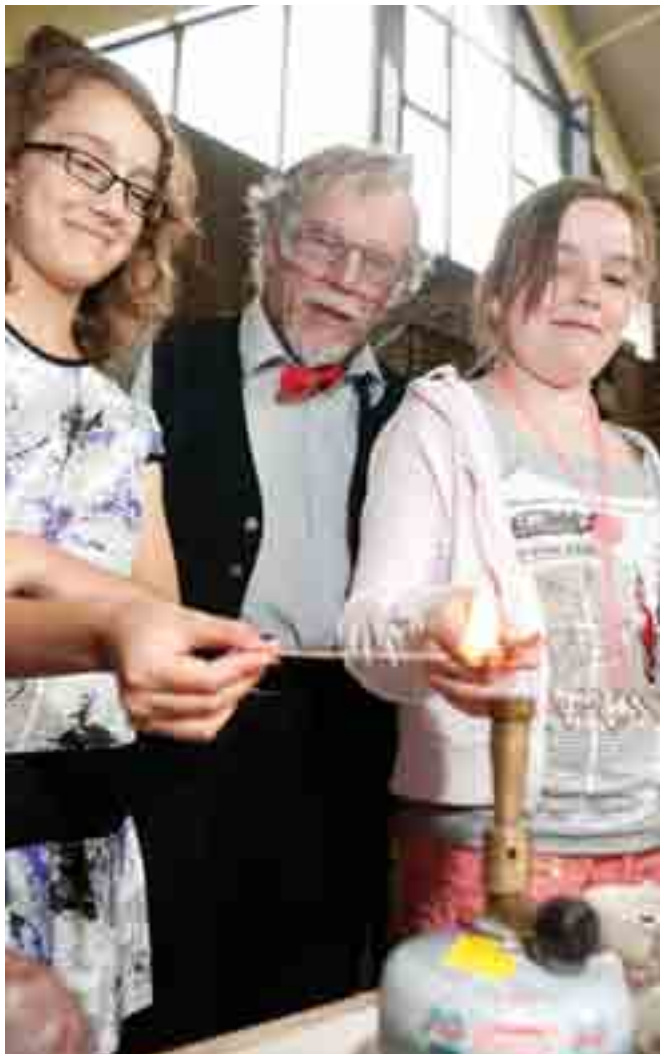
Experiments at Enginuity during the Coalbrookdale Festival.