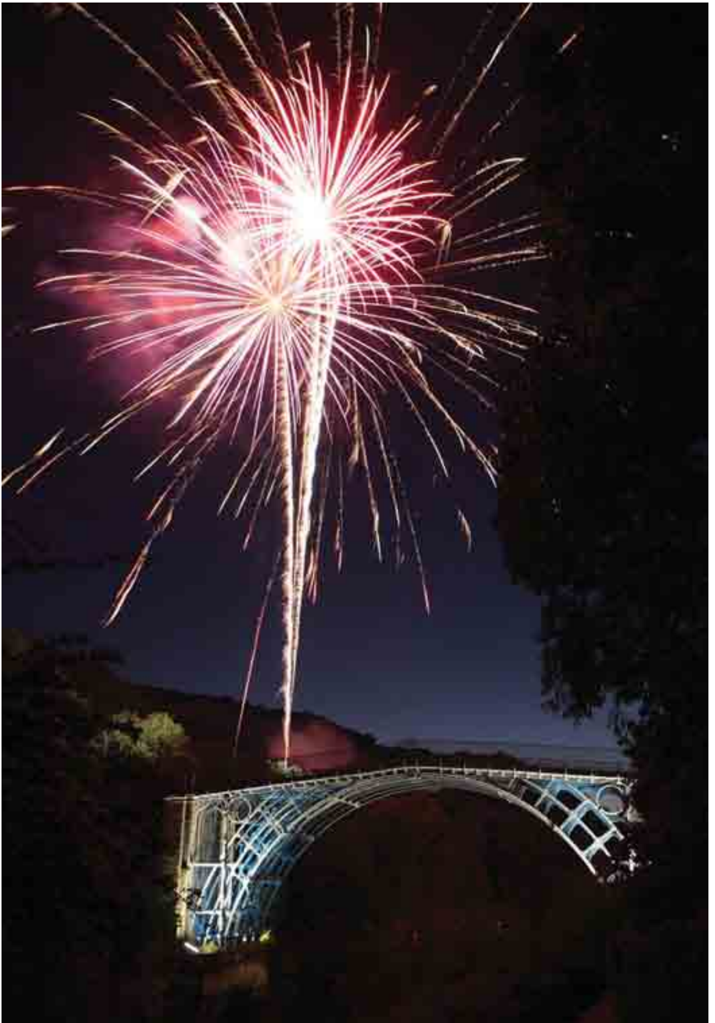
The Iron Bridge lit as part of the Ironbridge Gorge World Heritage Site Festival, September 2009.