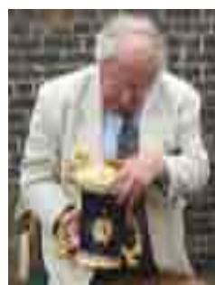
Henry Sandon inspects a Coalport Vase during the Antiques Roadshow filmed at Blists Hill.

The Coalbrookdale 300 anniversary was one of several West Midlands' anniversaries during 2009. These included the birth of Charles Darwin at Shrewsbury, the birth of William Penny-Brookes at Much Wenlock and the death of Birmingham-based manufacturer and Member of the Lunar Society, Matthew Boulton as well as the anniversary of the first Mini to roll off the production line at Longbridge in 1959. These anniversaries were collectively marketed as the Celebration of Imagination and were supported and promoted by Advantage West Midlands.