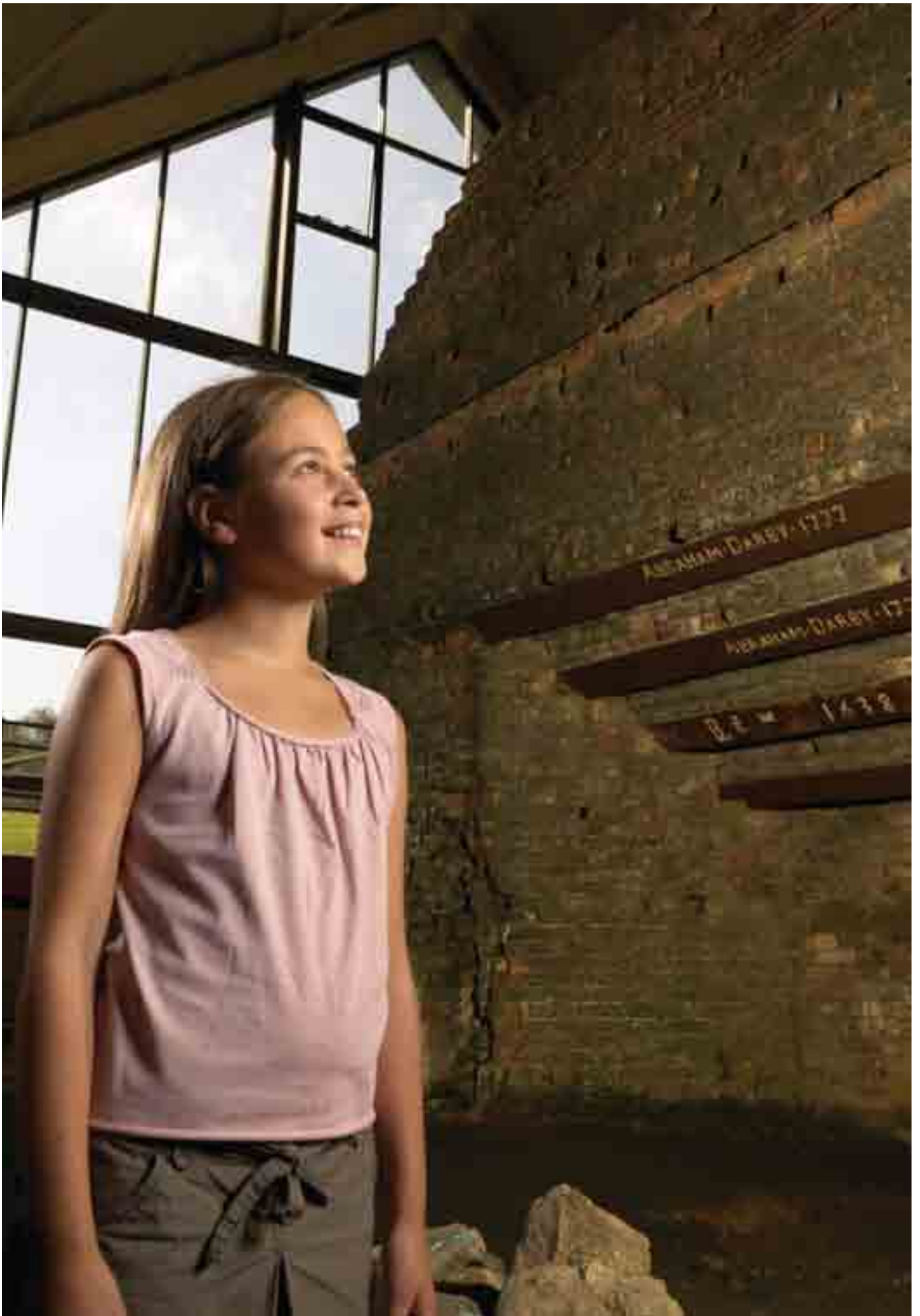
The Old Furnace at Coalbrookdale was reinterpreted during the year with support from the Edward Cadbury Charitable Trust Inc and the Heritage Lottery Fund.