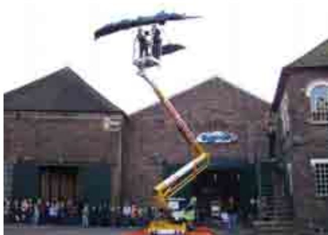
Enginuity Crash Test Glider Rally, November 2009.

Ironbridge continued its exciting progress as a centre for the promotion of the key curriculum subjects of science, technology, engineering and mathematics, ensuring the successful delivery of the STEM contract for the Shropshire area and expanding its network of SEAs – Science and Engineering Ambassadors - to over 100 by the end of the year. Highlights of 2009 included the Eginuity STEM Fair in March, The Big Bang West Midlands (UK Young Scientists' and Engineers' Fair) in July and The Eginuity Crash Test Glider Rally in November. The Eginuity team also enjoyed success during the year when they won the prestigious Arts & Business Award 2009 for the best business partnership with local Volkswagen dealership Inchcape Motors.