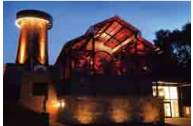
New Landmark Visitor Centre at Blists Hill VICTORIAN TOWN.

Since the completion of the redevelopment the Museum has enjoyed its highest annual visitor figures for over 10 years as well as receiving wide spread public and industry acclaim for the project.