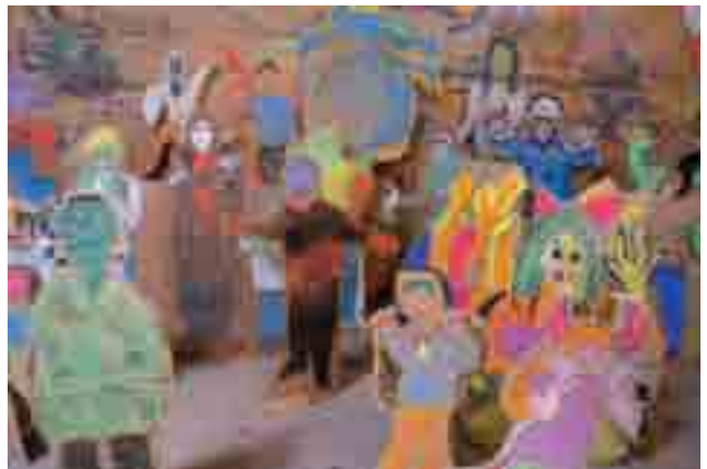
Big Draw Event at Blists Hill VICTORIAN TOWN.

At Coalport China Museum the October half term activities very successfully took inspiration from the Broseley Dragon design and families worked together to create the Museum's very own willow dragon. The Big Draw Event at Blists Hill coincided with Halloween and family visitors were invited to have a digital image of themselves taken, from which they created an enlarged cardboard monster or mythical creature. There were over 150 of these creations on display in the Goods Shed on Ghostly Gaslight night.