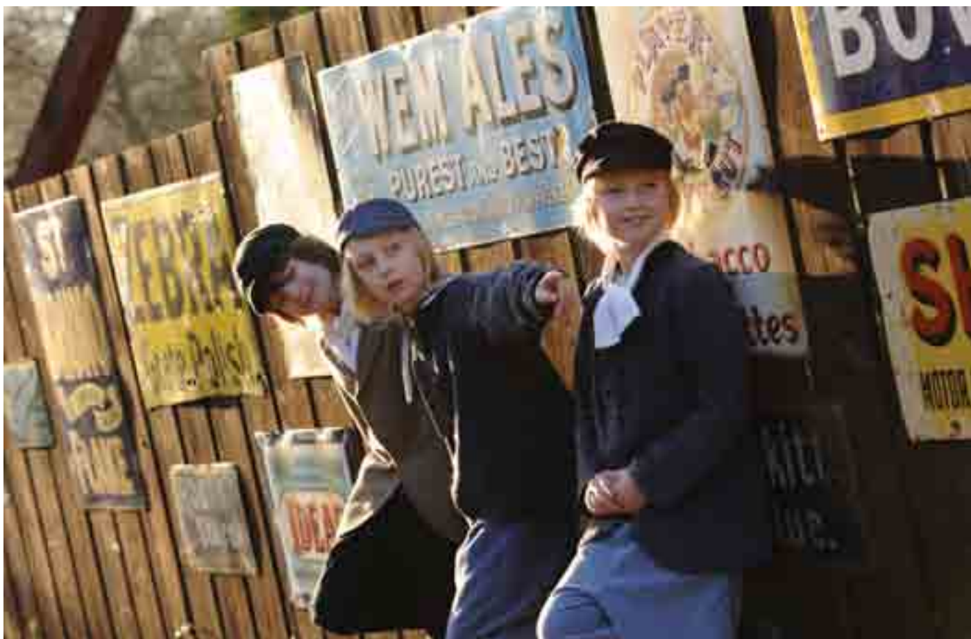
Street Kids at Blists Hill VICTORIAN TOWN.