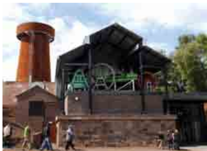
The new Blists Hill VICTORIAN TOWN Visitor Centre.

The £12m development has provided our visitors with a new landmark Visitor Centre and World Heritage Site exhibition along with the expansion of Canal Street to include a post office, draper's shop, photographers, sweetshop and fried fish dealer. On the lower part of the site, we have been able to create a narrow gauge mine railway and inclined lift along with greatly improved visitor facilities across all parts of the Town. The completion of the project has met with significant popular and critical acclaim, something which augurs well for the future.