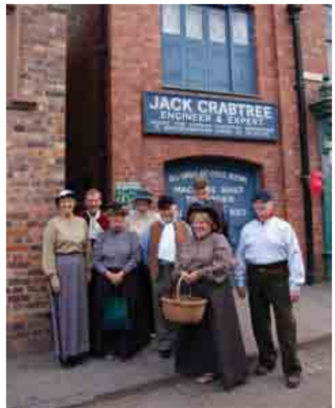
Volunteers at Blists Hill VICTORIAN TOWN.

The annual Livery Weekend in June organised by the London Committee of the Development Trust, together with Development Trust staff and volunteers was, once again, very successful with the majority of Masters from the City of London Livery Companies attending. The Development Trust remains fortunate in enjoying the commitment of so many hard working volunteers and Trustees, who contribute so much to the ongoing success of the Museum.