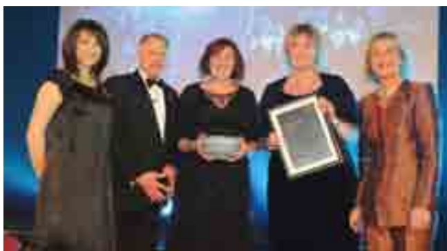
Blists Hill VICTORIAN TOWN wins the Best Large Visitor Attraction Award at the Heart of England Excellence for Tourism Awards 2009.

2009 saw the 300th anniversary of Abraham Darby I's successful commercial smelting of iron using coke and offered the Museum an unparalleled opportunity to refocus the world's attention on the reasons behind Ironbridge's World Heritage Site designation. During the year a phased series of exciting events were held to celebrate the anniversary including Fe09 - an international conference, a two day community festival and culminating with the Ironbridge Lecture delivered by Adam Hart-Davis. 2009 also formed the catalyst for the delivery of an ambitious capital development programme, the Coalbrookdale 300 Development Project which centres primarily on the Coalbrookdale site. Due to the generosity of the Edward Cadbury Charitable Trust (Inc) and the Heritage Lottery Fund funding was secured for the first stage of this ambitious refurbishment programme with improved access and a reinterpretation of the Old Furnace which was completed by the summer. It is envisaged that over £4m of capital will be required if our ambition for all phases of the development is achieved.