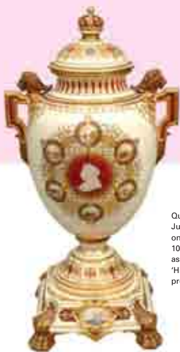
Queen Victoria Jubilee Vase, one of Shropshire's 10 objects selected as part of the 'History of the World' project.

During the year the Museum acted as a regional co-ordinator for the research phase of the national BBC & British Museum initiative A History of the World. This radio, web and events-based programme set out to explore the history of British regions and their global connections through individual objects.