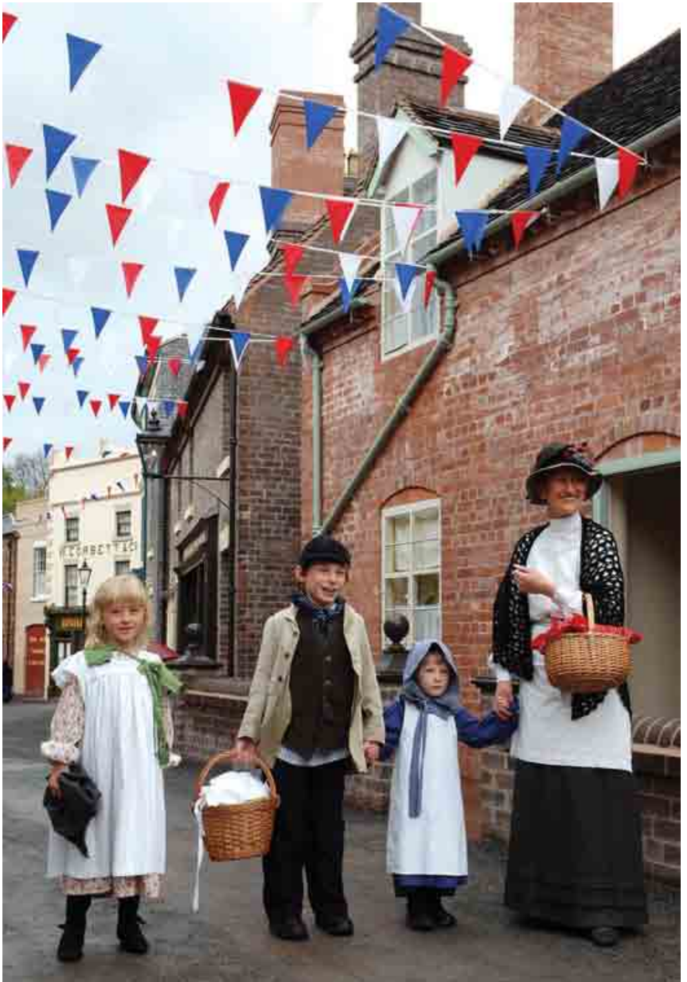
The opening of the new Canal Street, part of the Blists Hill Development Project, Easter 2009.