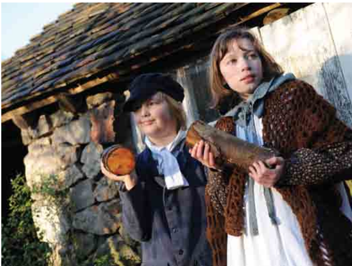
Street Kids outside the Squatter Cottage at Blists Hill VICTORIAN TOWN.