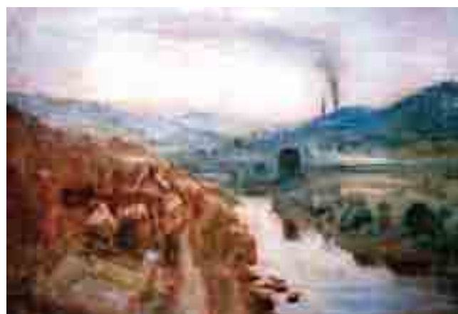
A View of Ironbridge, Shropshire by Philip Wilson-Steer 1860 - 1942. Oil on canvas.

In terms of the Museum's Library & Archives, 2009 saw the completion and publication of the Public Catalogue Foundation's volume "Oil Paintings in Public Ownership in Herefordshire, Worcestershire & Shropshire" utilising research by Library & Archives staff which had taken place during 2007-8. This important work will serve as a valuable reference source for years to come.