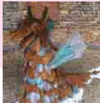
Coalport willow dragon.

Working with the Children's Centres across Telford, our dedicated Early Years Day at Blists Hill was well attended by local families and our Make Your Own Museum Project saw 90 children at Wrekin View Primary School research the many aspects of museum work before producing their own themed exhibits in shoe boxes.