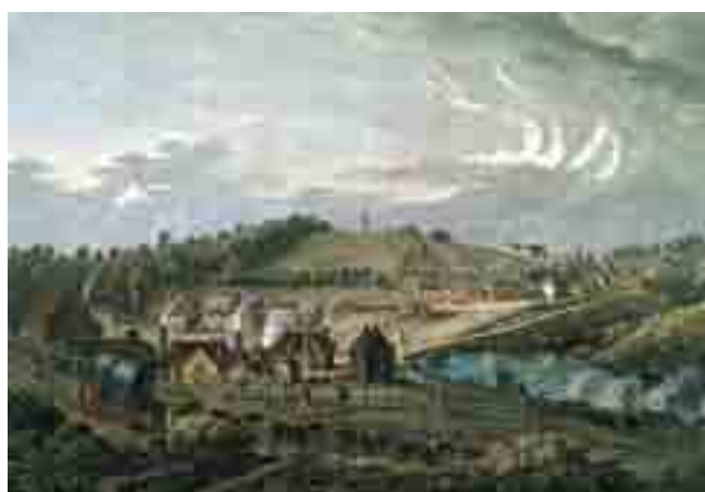
View of the Upper Works at Coalbrookdale, in the County of Salop by Françoise Vivares, 1758. (IGMT).

Loans were made by the National Museum of Wales and Shrewsbury Museum Service, who kindly loaned two significant paintings by the renowned artist William Williams, depicting views of Coalbrookdale in the 1770s. As part of the Coalbrookdale 300 celebrations and in partnership with the nearby Museum of Steel Sculpture, an exhibition of contemporary iron and steel sculpture was held in front of the Old Furnace, with additional works and sketches displayed in Enginuity.